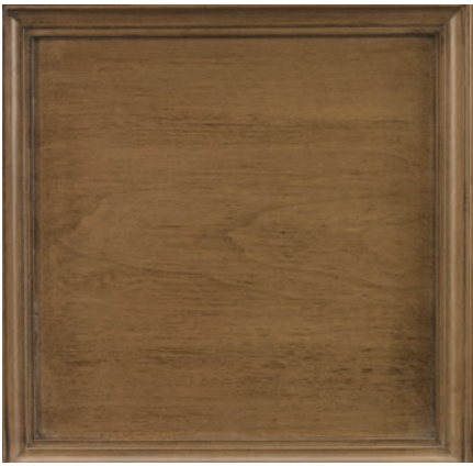
DRIFTWOOD: 31 A naturally aged pecan toned finish that has been enhanced with a bleached grey-beige overtone to characterize a lightly weathered antique.