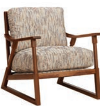
H143C Chambon Chair W29 D36 H32 PAGE: 12, 13, 22-23