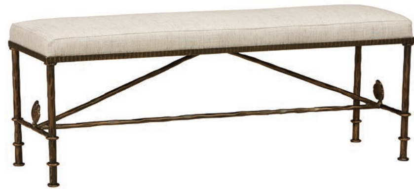
H604B Diego Bench OVERALL: W53 D17 H19 APPROX. SEAT HEIGHT: 19 ALL WELDED IRON FRAME BRONZE FINISH AS SHOWN ONLY