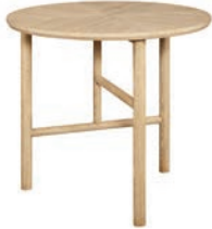
MH25329-90 Post and Beam Center Table DIA36 H31.5 PAGE: 21