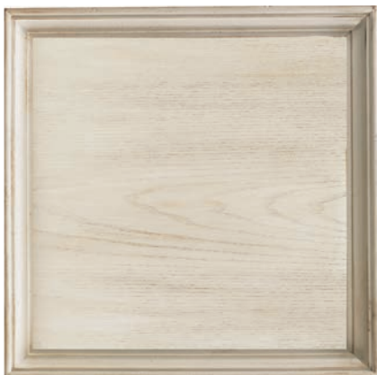
SANCERRE: H2 A warm, creamy ivory painted finish with a very light brush-stroke glaze applied over the top.