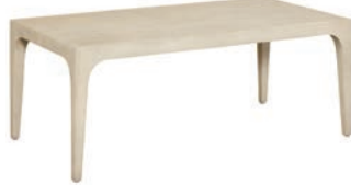
MH25312-90 Gabriel Cocktail Table W47 D23 H20 PAGE: 6-7, 24, 25, 27