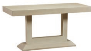
MH25331-H2 Gabrielle Console W60 D26 H30 PAGE: 1, 18-19, 20