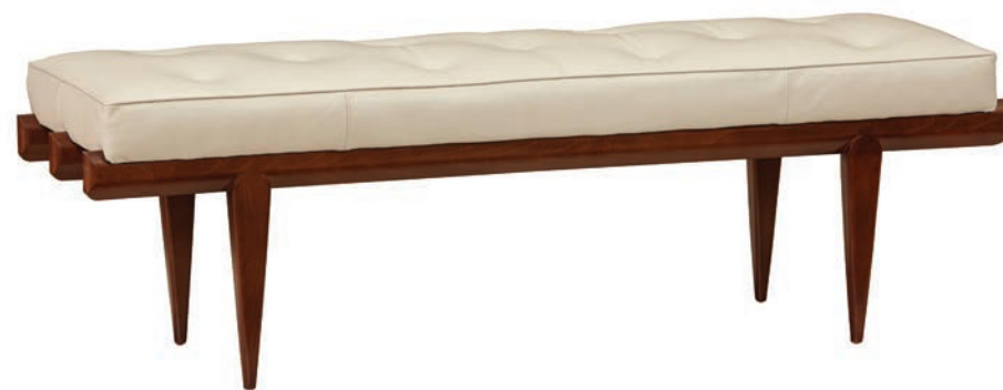
H205B Arne Bench OVERALL: W63 D18 H18 APPROX. SEAT HEIGHT: 18 LIGHTLY BUTTONED, TIGHT SEAT CUSHION SHOWN IN SELECTED FINISH: #54 SOHO