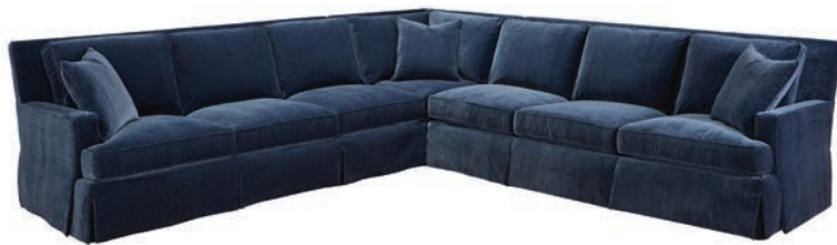
H744LL Fairfax Left Arm Loveseat H744RL Fairfax Right Arm Loveseat W62 D42 H36