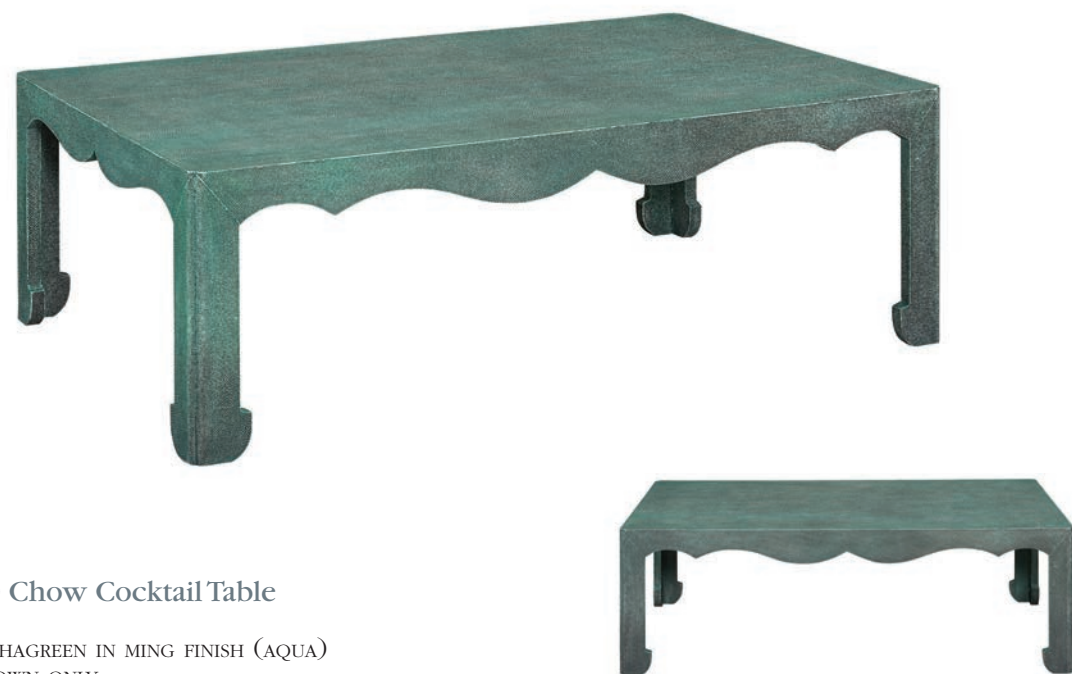
MH25310-90 Chow Cocktail Table w56 d36 h18 WRAPPED FAUX SHAGREEN IN MING FINISH (AQUA) AVAILABLE AS SHOWN ONLY