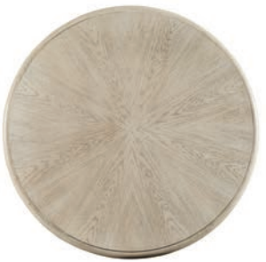
MH25320 Paddles Table DIA32 H30 OAK SOLIDS AND VENEERS SHOWN IN CUSTOM FINISH: H2 SANCERE OPTIONAL FINISHES AVAILABLE