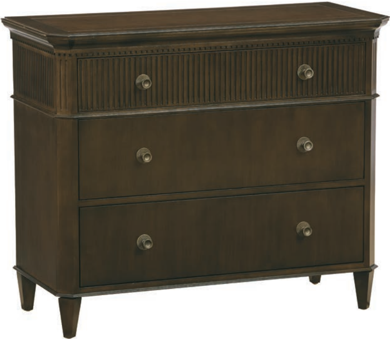
MH25361 Gustav IV Chest w40 d18 h34 MAPLE SOLIDS AND MAPLE VENEERS THREE DRAWERS WITH REEDED TOP DRAWER FACE AND SIDE PANELS CLIPPED CORNER, BORDERED TOP SOLID BRASS HARDWARE SHOWN IN OPTIONAL FINISH: #A2 MODERN ELM OPTIONAL FINISHES AVAILABLE