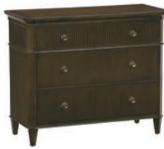
MH25361 Gustav IV Chest W40 D18 H34 PAGE: 31