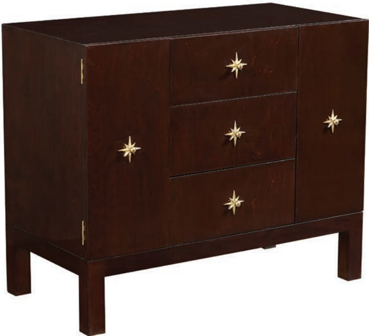
MH25360-90 Streisand Chest w36.375 d18 h30 MAPLE SOLIDS AND MAPLE VENEERS TWO DOORS WITH INTERIOR ADJUSTABLE SHELVES SEPARATED BY THREE DRAWERS CUSTOM BRASS STARBURST HARDWARE ONLY AVAILABLE AS SHOWN