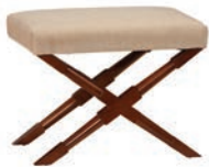
H206B Frank Stool W25 D17 H19 PAGE: 15