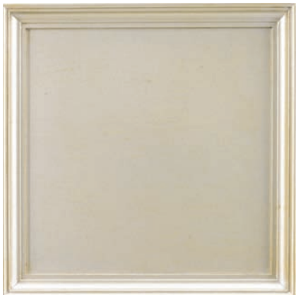
PLATINUM: 03 A metallic finish with an underlying base of silver and very subtle hand-padded gold overtones giving a platinum patina.