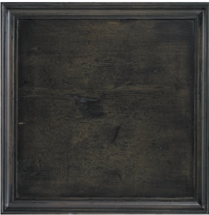
MALABAR: C3 A wonderfully soft black finish with brown undertones.