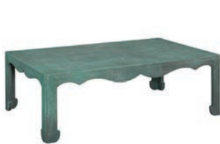
MH25310-90 Chow Cocktail Table W56 D36 H18 PAGE: 12, 22-23, 24