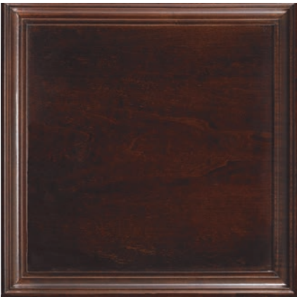
CASHMERE: C7 Like a treasured cashmere scarf, the warmth and elegance of this high-sheen dark walnut finish adds a touch of class and refinement to any item.