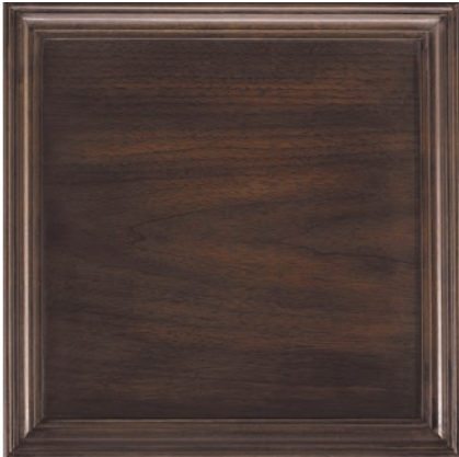
MODERN WALNUT: A1 A rich, warm, high sheen brown finish that emphasizes the clarity and natural beauty of the wood beneath.