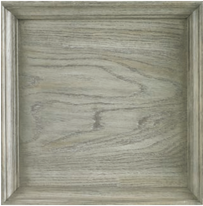
EARTH GREY: N6 Casual light grey hues with a dry antique vintage character.