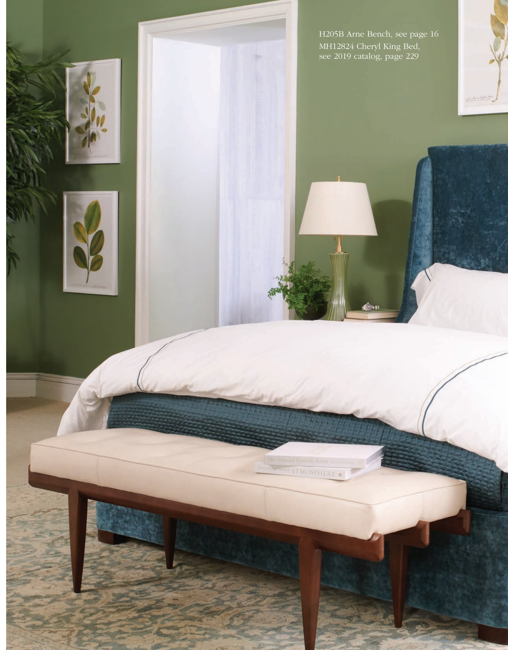
H205B Arne Bench, see page 16 MH12824 Cheryl King Bed, see 2019 catalog, page 229