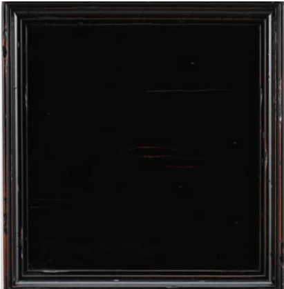
EBONY: 44 A rich rubbed-through black finish that highlights the underlying wood tones with a lustrous satin-like patina.