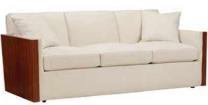
H736S Manderley Sofa W83 D38 H33 PAGE: 5, 6-7, 25, 27