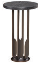
MH25322-91 Rateau Spot Table DIA14 H23 PAGE: 26, INSIDE BACK COVER