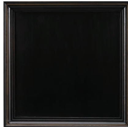
SABLE: 53 A rich dark brown high sheen finish with excellent clarity. A handsome Bronze accent stripe is added to the Stratos (530) collection to complement and enhance its richness.