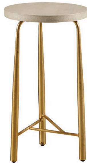
MH25323-91 Baton Spot Table