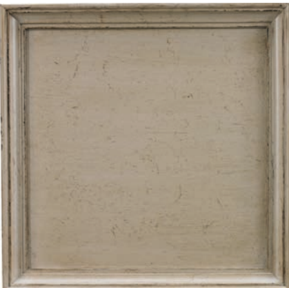
DOVE: 21 A soft patinated Belgian grey finish, hand burnished and detailed with a gently spattered antique glaze.