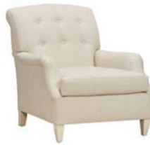
H457C Smith Chair W32 D39 H36 PAGE: 14