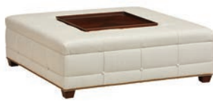
H281OT Avino Ottoman W45 D45 H15 PAGE: 10-11, 15