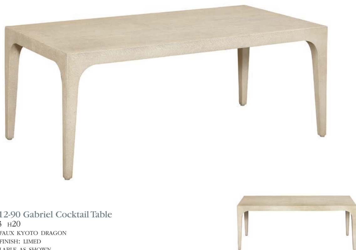
MH25312-90 Gabriel Cocktail Table w47 d23 h20 WRAPPED FAUX KYOTO DRAGON SELECTED FINISH: LIMED ONLY AVAILABLE AS SHOWN

MH22321-91 Luna Side Table, see 2019 catalog, page 180 H736S Manderley Sofa, see page 5 MH25312-90 Gabriel Cocktail Table, see page 24