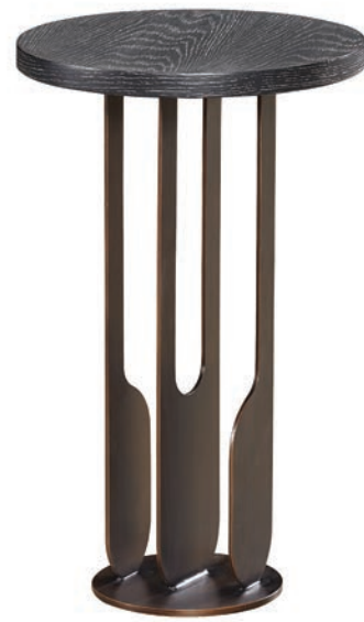
MH25322-91 Ratean Spot Table