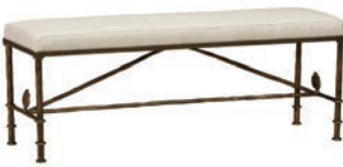
H604B Diego Bench W53 D17 H19 PAGE: 16