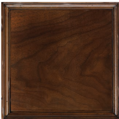
SOHO: 54 A rich medium value clear brown finish reminiscent of a lightly burnished antique pecan with a medium sheen level.