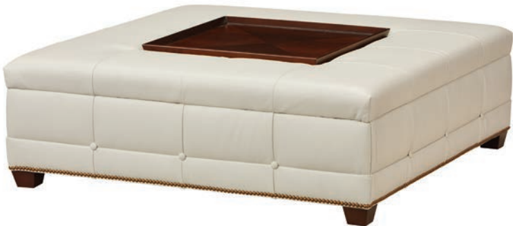
H281OT Avino Ottoman OVERALL: W45 D45 H15 APPROX. SEAT HEIGHT: 15 BISCUIT PATTERNED AND BUTTONED REMOVABLE WOOD TRAY EXPOSED WOOD LEGS SHOWN IN OPTIONAL FINISH: #C3 MALABAR OPTIONAL FINISHES AVAILABLE STANDARD WITH #2-FN NAIL TRIM AROUND BASE SHOWN WITH #2-OB NAILS IN PLACE OF STANDARD