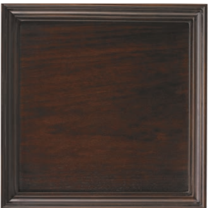
WALNUT: 65 A sophisticated satin finished walnut brown with russet undertones enhancing the natural beauty of wood.