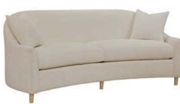
H711S Raddi Sofa W86 D42 H37 PAGE: 2-3, 4