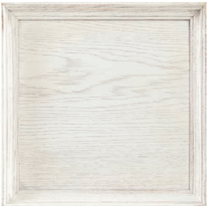
SANDSTONE: P6 Casual lighter hue, whitewashed canvas effect. Depth of finish is subtle and crafted with character.