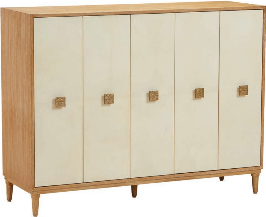
MH25351-90 Samuel Cabinet w64 d18 h42 CERUSED BLEACHED OAK WITH FIVE VELLUM DOORS ADJUSTABLE INTERIOR SHELVES TEXTURED BRASS HARDWARE ONLY AVAILABLE AS SHOWN