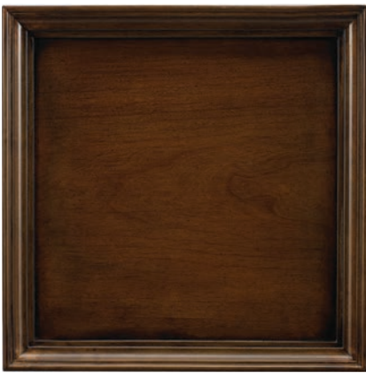
LANCASTER: 13 Medium brown satin finish with hand-applied burnishing and light visual distressing reminiscent of a well cared for 19th century antique.