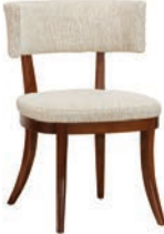
H129AC Robsjohn Chair W26 D27 H37 PAGE: 1, 9, 18-19