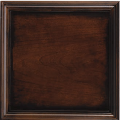
NEWPORT: 07 An elegant, clear medium-brown finish with very light aging and the subtle burnishing of a well cared for antique.