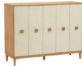
MH25351-90 Samuel Cabinet W64 D18 H42 PAGE: 30