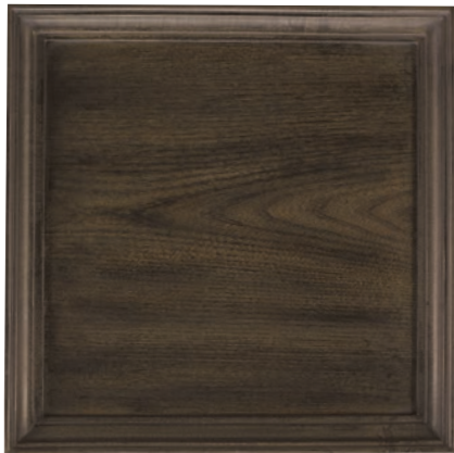
MODERN ELM: A2 Developed to take advantage of the striking grain pattern of elm veneers, this warm greyish-brown finish creates a soft, transitional appearance.