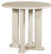
MH25320 Paddles Table DIA32 H30 PAGE: 21, 37