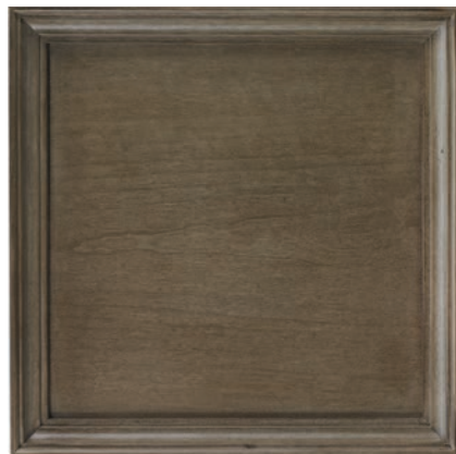
STONE: 79 Very clean grey-beige finish that reads through to the beauty of the wood grain beneath providing a handsome casual transitional feel.