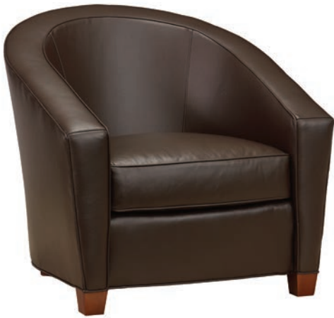
HL449C Bennett Leather Chair OVERALL: W34 D34 H32 INSIDE: W23 D23 H16 ARM HEIGHT: 25 APPROX. SEAT HEIGHT: 19 TIGHT BACK LOOSE SEAT CUSHION SHOWN IN OPTIONAL FINISH: #A1 MODERN WALNUT SELECTED FINISH: #54 SOHO OPTIONAL FINISHES AVAILABLE