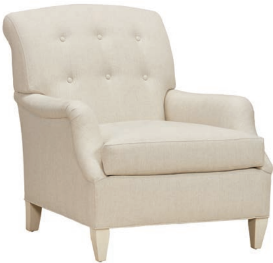
H457C Smith Chair OVERALL: W32 D39 H36 INSIDE: W21 D24 H20 ARM HEIGHT: 23 APPROX. SEAT HEIGHT: 18 LOOSE SEAT CUSHION TIGHT BUTTONED BACK SHOWN IN OPTIONAL FINISH: #H2 SANCERRE SELECTED FINISH: #54 SOHO OPTIONAL FINISHES AVAILABLE