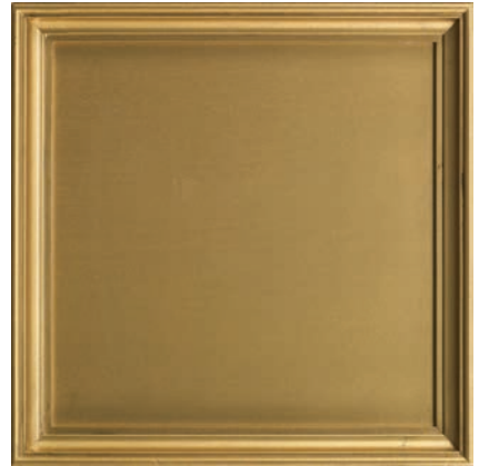
GOLD: F4 A deep gold multi-layered lacquer finish with a medium sheen that is dry brushed and lightly spattered.