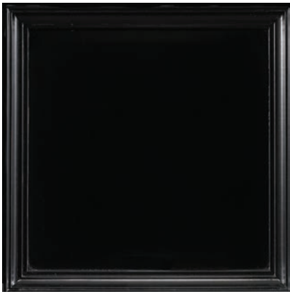
CAFÉ NOIR: C8 The color of rich, dark Columbian coffee, Café Noir is a beautifully sleek black/brown finish with a high sheen.