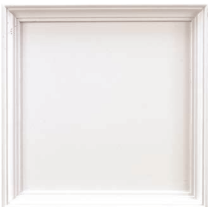
SUGAR: 27 An opaque, clean white finish with a very slight intermittent rub-through along the perimeter edge.