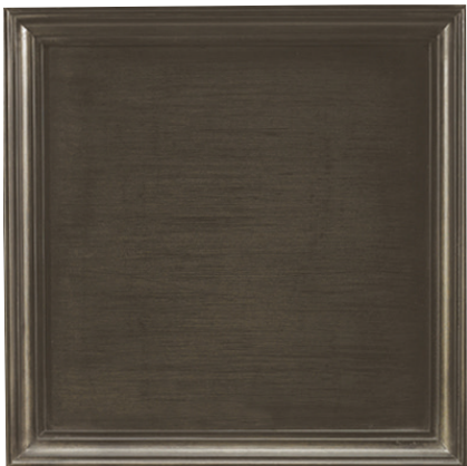
BLACK NICKEL: 39 A deep nickel-colored paint finish with very fine black brushing on top to resemble black nickel metal.