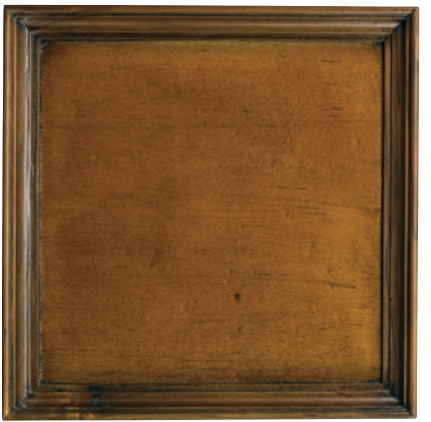
MEDIUM ANTIQUE: LM A lighter tone fruitwood finish, highlighted and lightly burnished with a medium sheen level.