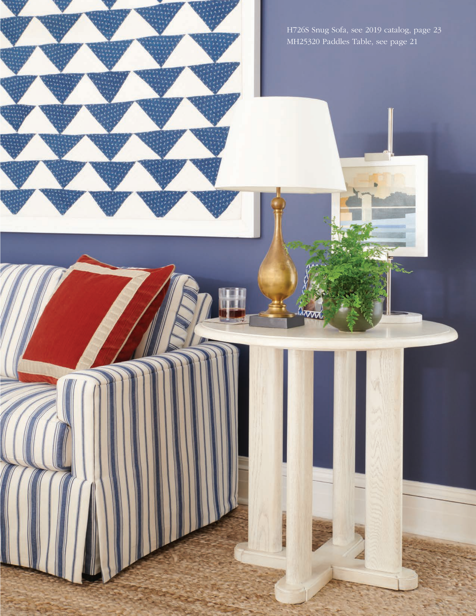
H726S Snug Sofa, see 2019 catalog, page 23 MH25320 Paddles Table, see page 21

Available only on MH10314. A hand-painted decorative finish resembling exotic Palisander wood grain laid out in a patchwork grid. Each item will be unique.