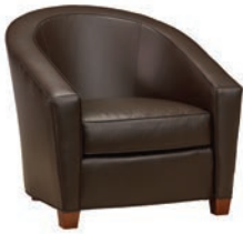
H449C Bennett Chair HL449C Bennett Leather Chair W34 D34 H32 PAGE: 14