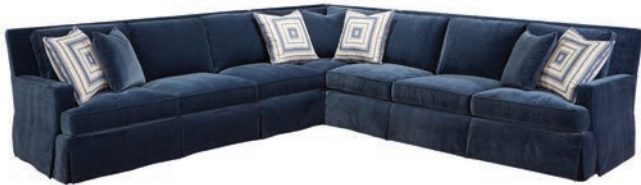
SHOWN WITH FOUR OPTIONAL THROW PILLOWS

OVERALL: W104 D42 H36 INSIDE: W83 D23 H19 STANDARD WITH ONE 19" THROW PILLOW