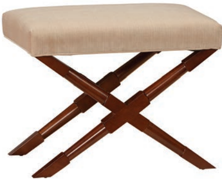
H206B Frank Stool OVERALL: W25 D17 H19 APPROX. SEAT HEIGHT: 19 TIGHT TOP EXPOSED CARVED WOOD FRAME SHOWN IN OPTIONAL FINISH: #A1 MODERN WALNUT SELECTED FINISH: #54 SOHO OPTIONAL FINISHES AVAILABLE