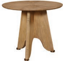
MH25328-90 Rateau Center Table DIA36 H30 PAGE: 20