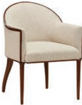
H142C Perriand Chair W26 D28 H34 PAGE: 9