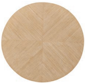
MH25329-90 Post and Beam Center Table DIA36 H31.5 OAK SOLIDS AND OAK VENEERS SHOWN IN SELECTED FINISH: WEATHERED OAK ONLY AVAILABLE AS SHOWN