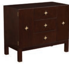
MH25360-90 Streisand Chest W36.375 D18 H30 PAGE: 28, 29