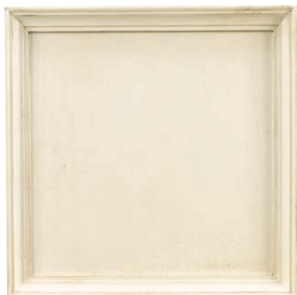
WASHED LINEN: 34 A very pleasing clean, off-white finish with a very light rub through providing the natural look of washed cotton or flax.