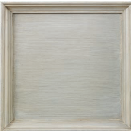
SEA GLASS: F6 A very unique strie finish generated by a hand-brushing technique that emulates a sea glass like finish. Creamy white texture over pale iridescent, seafoam green-cast undertones. Overall a rich textured creamy finish.