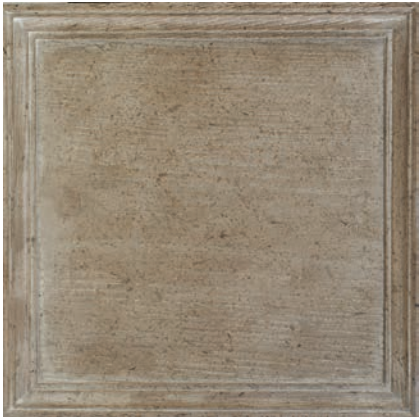
WASHED CANVAS: J3 A multi-step finish designed for the open grained nature of ash. This finish has a white filler intended to hang up in the grain, then sealed, dry-brushed, visually distressed, and finished with three coats of lacquer. Available on Ash case goods only.